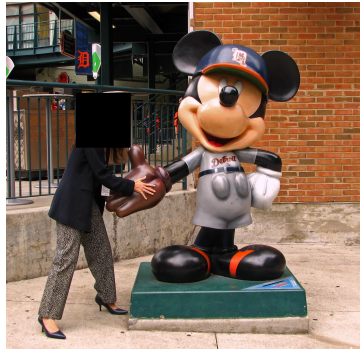
(a) Image from the training dataset