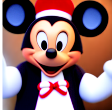
(b) Generation for the prompt "Mickey Mouse"

Figure 2: CommonCanvas is a research tool and text-to-image model [55], trained only using images with Creative Commons licenses. One can think of this model as a “gold-standard” baseline that does not contain in-copyright images of Mickey Mouse: the only examples in the training data that reflect the higher-order concept of “Mickey Mouse” are from personal photographs, e.g., (a) (redacted for privacy). Even without unlicensed, in-copyright training examples of Mickey Mouse, the model can generate outputs that resemble “Mickey Mouse,” e.g., (b).